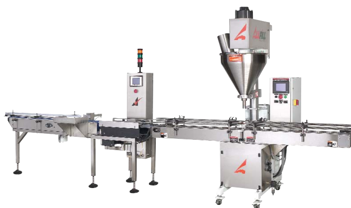
Model SHA-SV with optional CW-10 Checkweigher